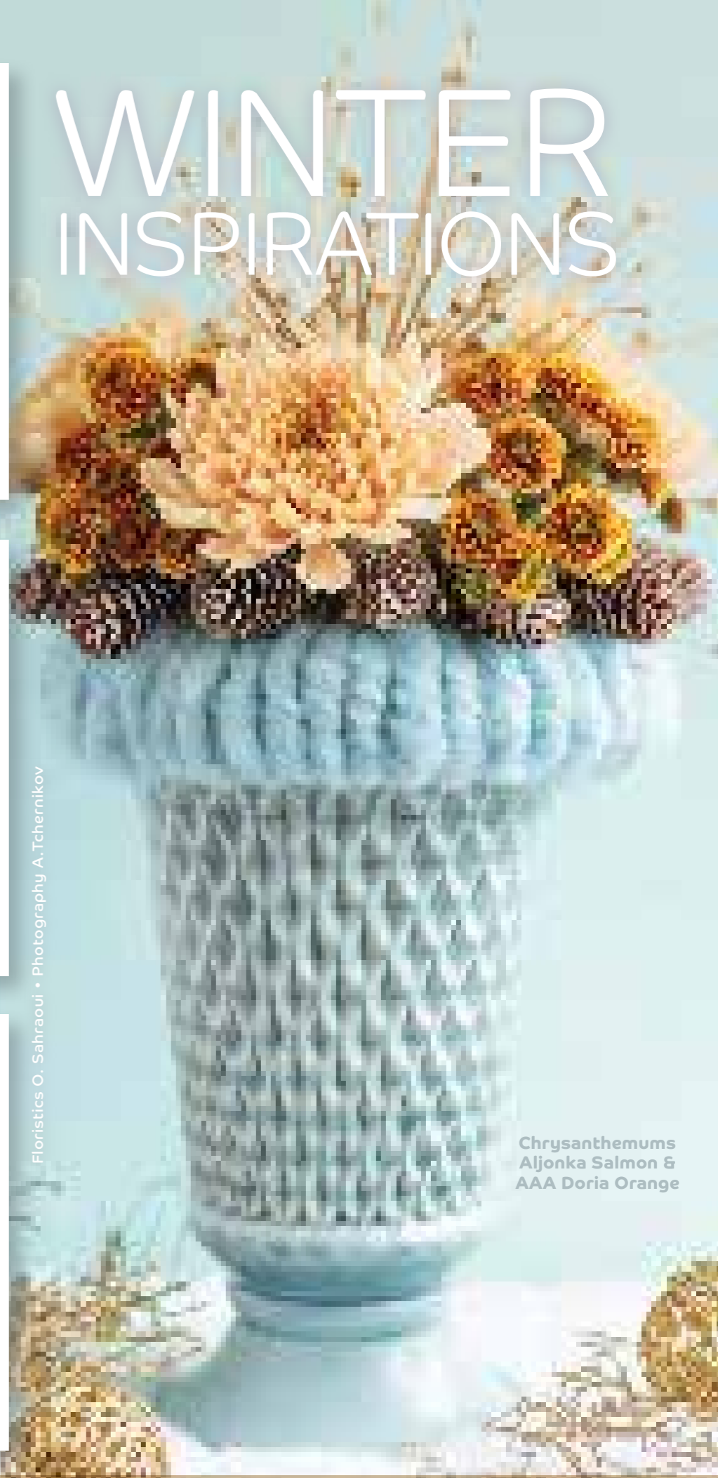
Chrysanthemums Aljonka Salmon & AAA Doria Orange

Floristics O. Sahraoui