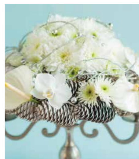
White Zehnya & Santini Sangi

Fancying a posh winter wedding arrangement that will blow everybody's mind? Use saturated colours and different bulb shapes of Dekker Chrysanten to create the core of the arrangement. Choose dark bordeaux and bronze to make it dramatic and festive. These are extremely trendy shades for the winter creations! Try intense coloured Santini AAA Kiku Edvaldo with dahlia and some branches of phalaenopsis Bohemian Rome, Rosebud and Euphorbia. It will add more air to the arrangement and make it light and elegant. Decorate it in a shiny vase and Voilá: the glamorous winter eyecatcher is ready!