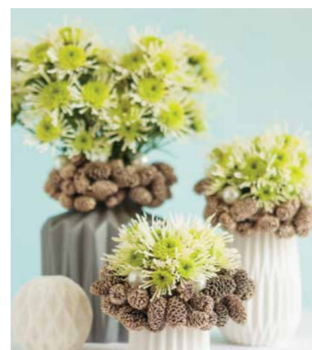
Chrysanthemum AAA Anura Green