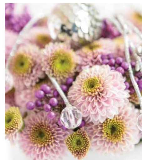
Chrysanthemum AAA Doria Pink